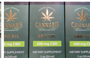
Short Run Packaging (Polymer Foil)