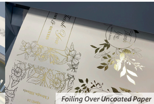
Foiling Over Uncoated Paper