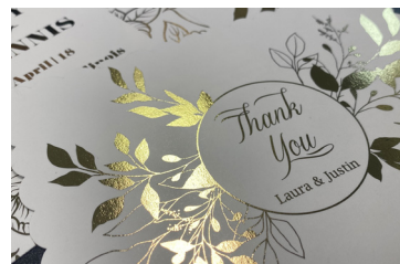
Invitations (Toner Foil)