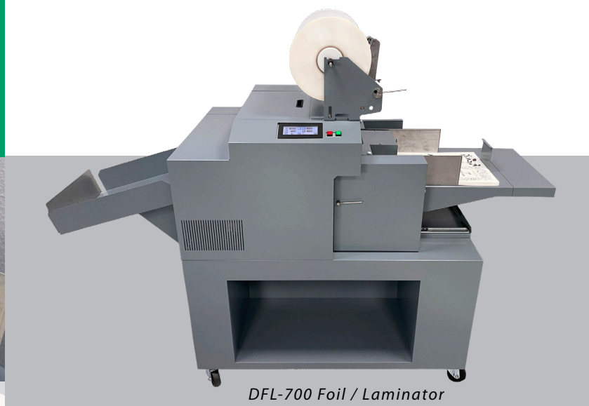
DFL-700 Foil / Laminator

The DFL-700 works with metallic, holographic, and glitter foils. Duplo USA offers a selection of colors to meet your needs.