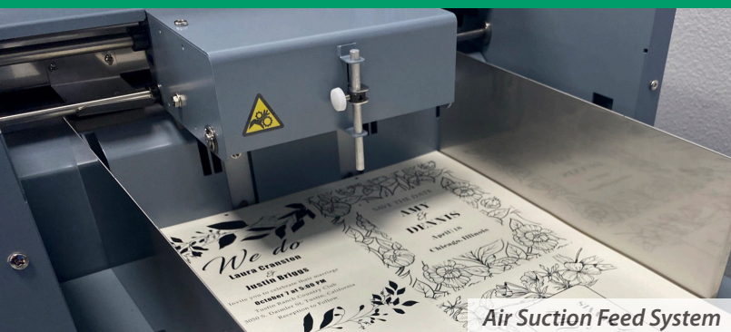
Air Suction Feed System

Foil invitations and greeting cards without the use of stamping dies. Produce raised foil effects on spot coated business cards and packaging without the cost. With a speed of up to 40 sheets per minute, the DFL-700 provides a cost-effective solution for digital foiling and lamination on demand.