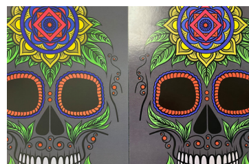
Book Covers (Laminated vs Non-Laminated)