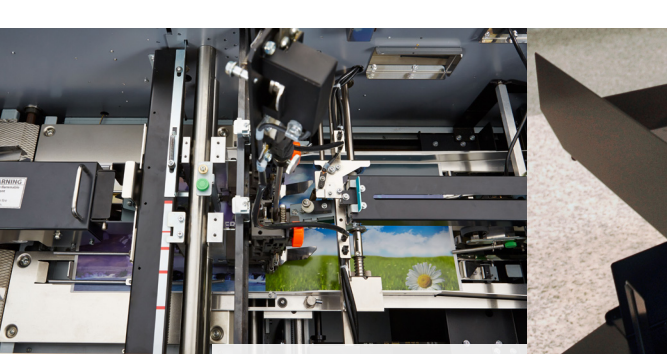
DBM-350 Stitching Section