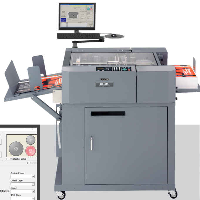
DC-616 shown with optional PC and PC arm.

Creasing digitally-printed output prior to folding prevents toner cracking and unattractive fold lines. The creaser utilizes male and female matrix channels to create a hinge along the sheet to be folded with ease. Creasing performance can be optimized by using the adjustable 3-step depth crease for various paper types and weights.