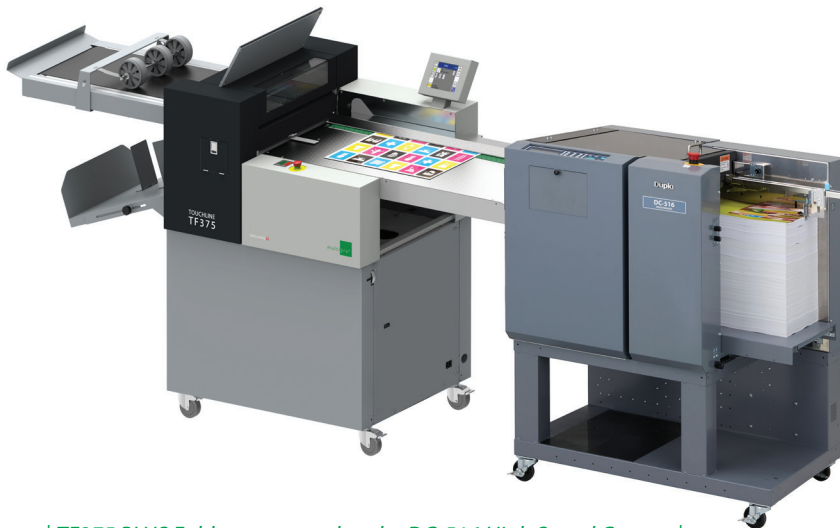
| TF375 PLUS Folder connected to the DC-516 High Speed Creaser |