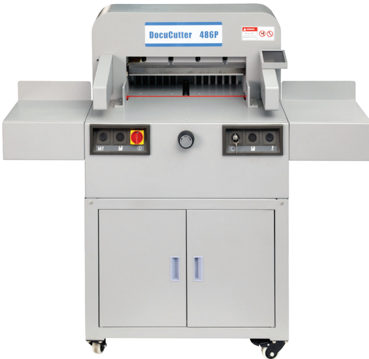
| 486P Electric Cutter |